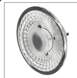
Additional 60° lens is included in the package